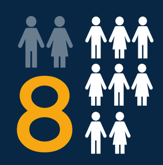
out of 10 use the Bank Details Approval process to reduce fraud*

B4B sites have seen radical improvements to the efficiency and compliance of their payments process of a minimum of 25%. Over 63%+ saw improvements of 50-75% *